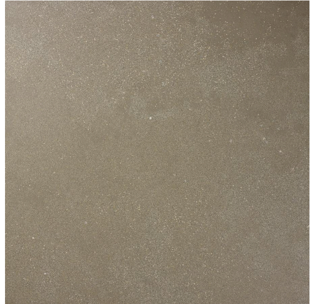
Concrete Project Marron natural