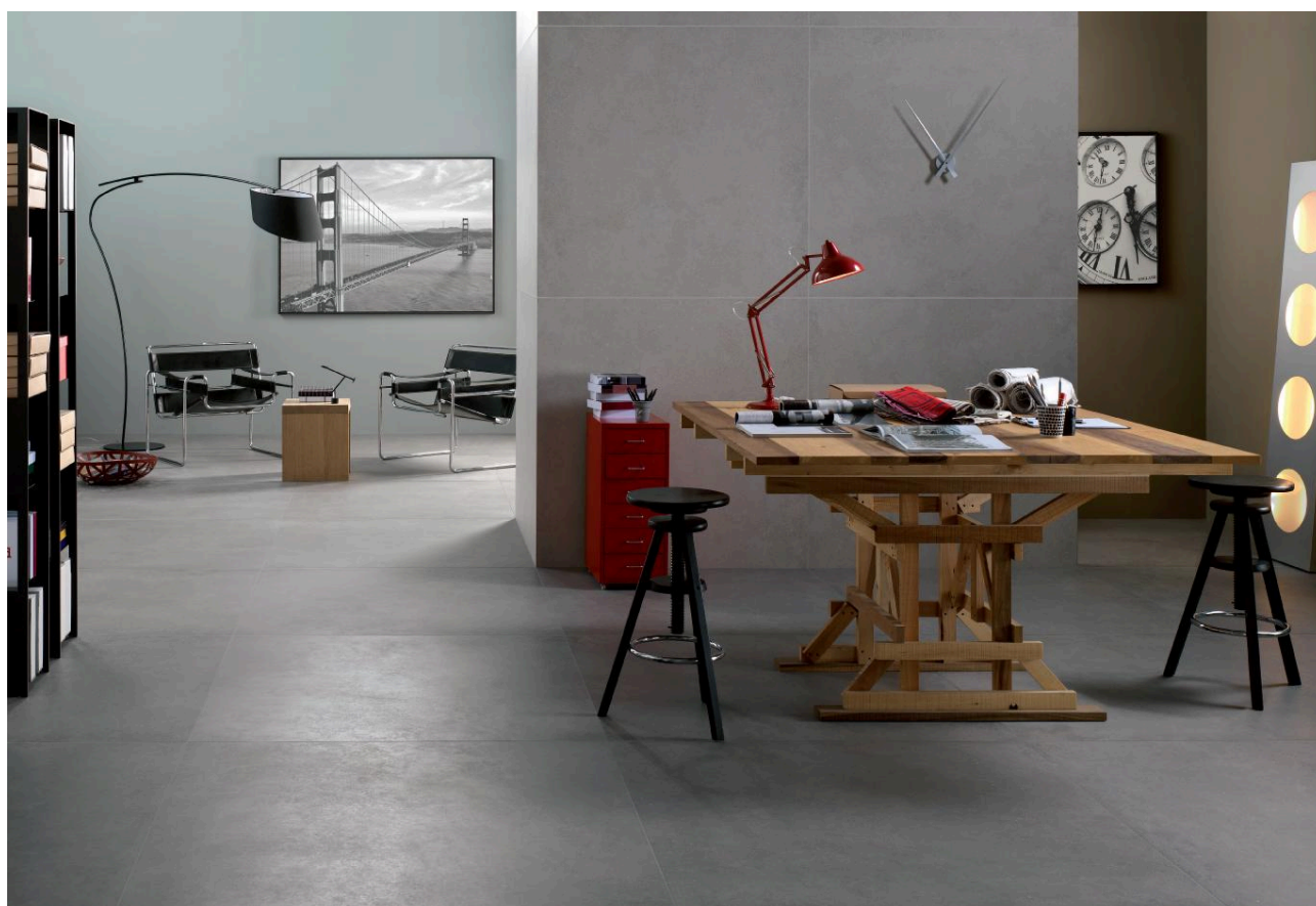
Concrete Project Dark Grey

Variation is an inherent property of tiles and stone. Sizes are nominal and may vary between manufacturers. Sizes may include a joint. Tiles supplied may vary from samples provided.