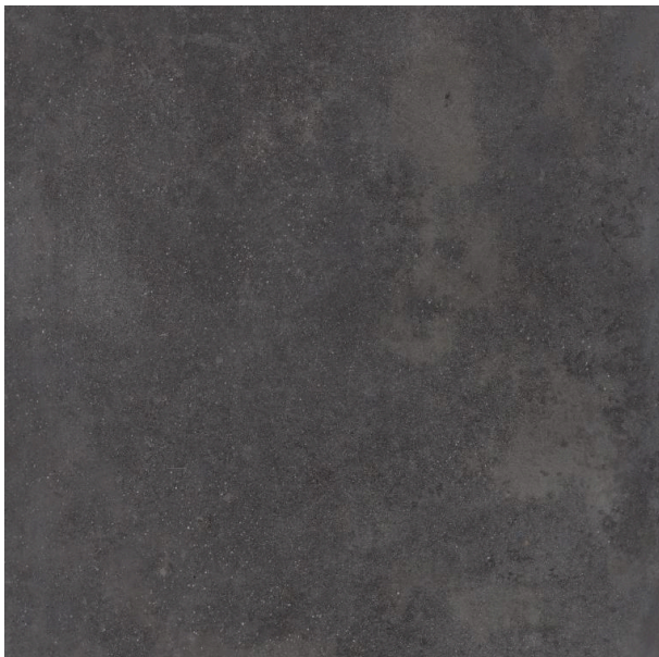
Concrete Project Dark Grey natural