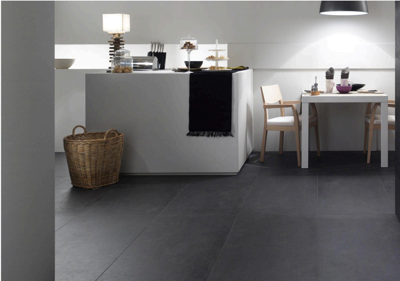
Concrete Project Nero

Variation is an inherent property of tiles and stone. Sizes are nominal and may vary between manufacturers. Sizes may include a joint. Tiles supplied may vary from samples provided.