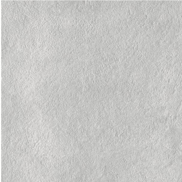
Concrete Project White natural