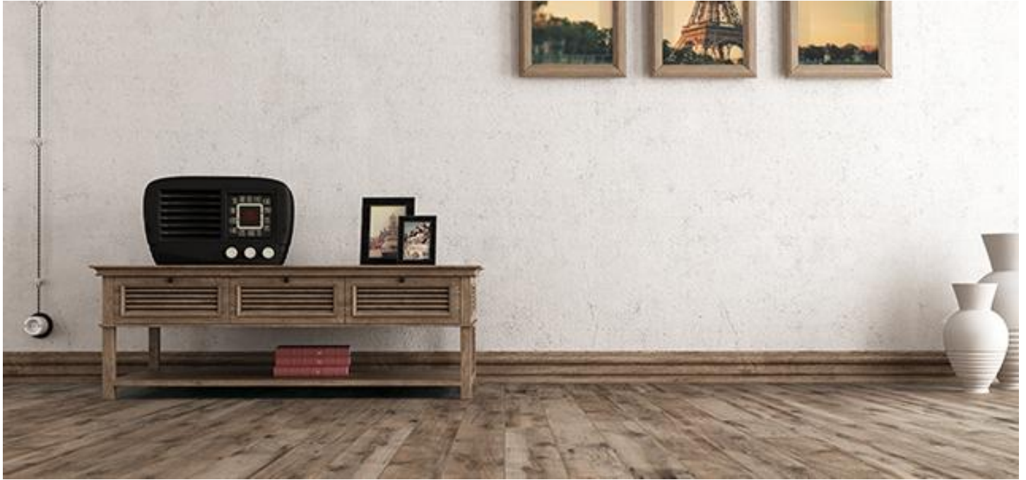
Vintage Dandy Nut