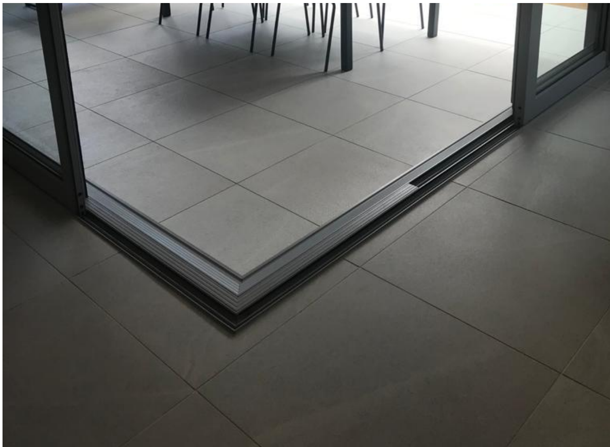
Landstone White internal & external