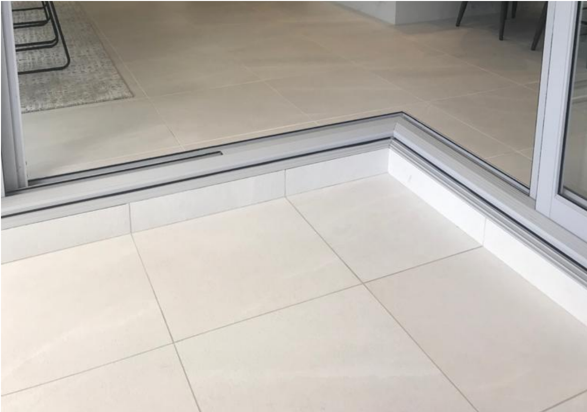
Landstone White internal & external